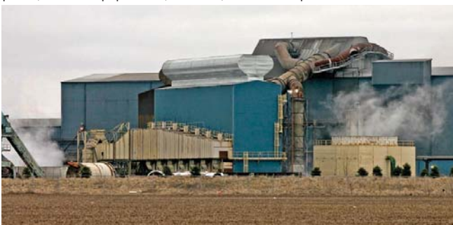
Figure 26-6. Electrostatic precipitators and other control devices help to reduce the emissions of particulate matter and gases from pollution sources, such as this steel mill. They are regarded as being 98–99% effective. Electrostatic precipitators are often used instead of baghouses when the particles are suspended in very hot gases, such as in emissions from power plants, steel and paper mills, smelters, and cement plants.

These techniques have vastly improved the quality of power plant emissions. There is, however, still more work to be done. Fossil fuel pollutants and the consumption of coal for power generation, in particular, remain the principal causes of acid rain and the greenhouse effect.