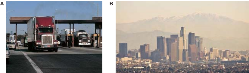
Figure 26-1. The very conveniences that make our lives easier and improve our standard of living are also harmful to the environment. A—Vehicle exhausts from cars and trucks are a major source of pollutants. B—Although air quality has been improved in recent years, many major cities still experience high levels of pollution at times.

breathing air, and polluting lakes and streams. At the global level, there is concern that the rapid consumption of so many fossil fuels over such a short period of time is resulting in worldwide climate change.