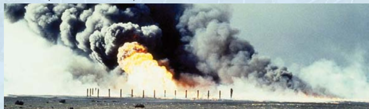
Figure 26-C. Oil well fires in Kuwait during the 1991 Persian Gulf War.

The worst oil spill worldwide occurred in 1991. It was not accidental at all. During the Persian Gulf War of 1991, Saddam Hussein, dictator of Iraq, ordered 250 million gallons of crude oil dumped into the waters of the Persian Gulf. This deliberate oil spill was the magnitude of 20 times greater than the Exxon Valdez disaster. Hussein's army also set fire to approximately 600 oil wells in Kuwait, creating an environmental disaster of epic proportion. See Figure 26-C . Using private contractors, the well fires were extinguished in about one year.